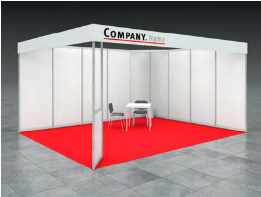
Example: 20sqm corner stand