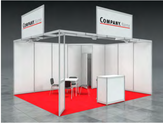
Example: 20sqm corner stand