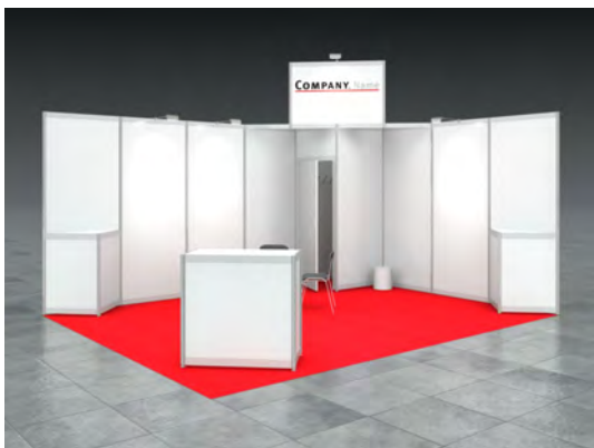
Example: 20sqm corner stand