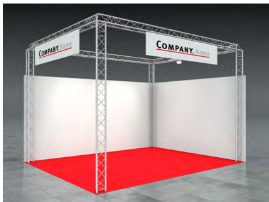
Example: 20sqm corner stand