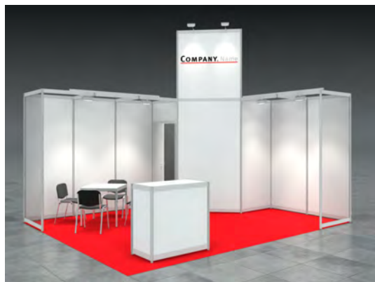
Example: 20sqm corner stand

We hereby order a rental stand HARRY according to our stand size.