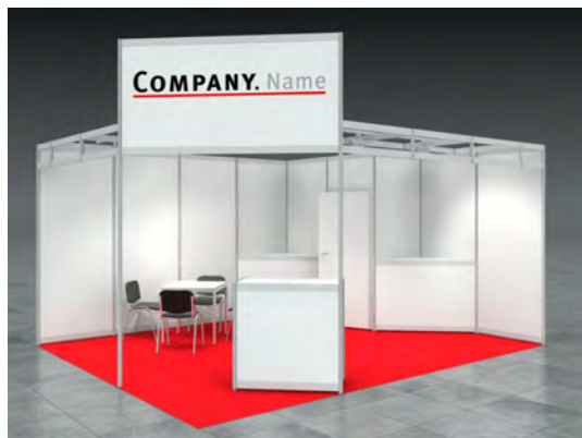
Example: 20sqm corner stand