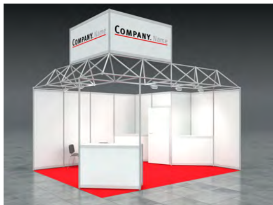
Example: 20sqm corner stand