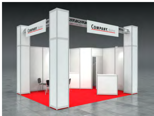
Example: 20sqm corner stand