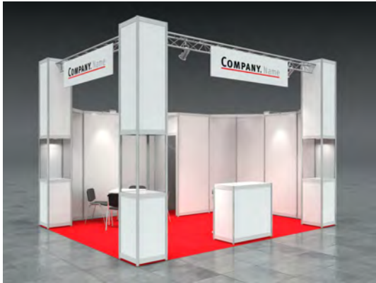
Example: 20sqm corner stand

We hereby order a rental stand LUKE according to our stand size.