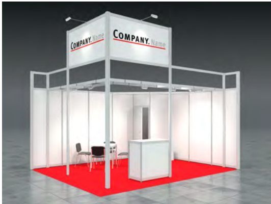
Example: 20sqm corner stand

We hereby order a rental stand DEAN according to our stand size.