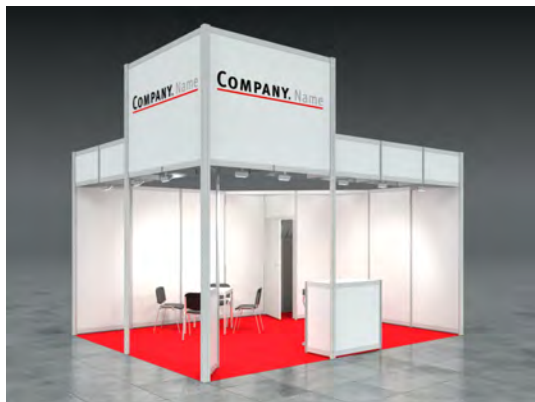
Example: 20sqm corner stand