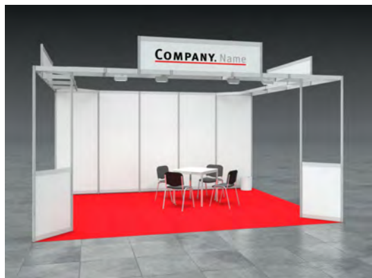
Example: 20sqm head stand