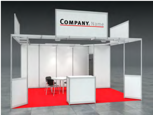
Example: 20sqm head stand