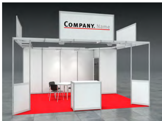
Example: 20sqm head stand