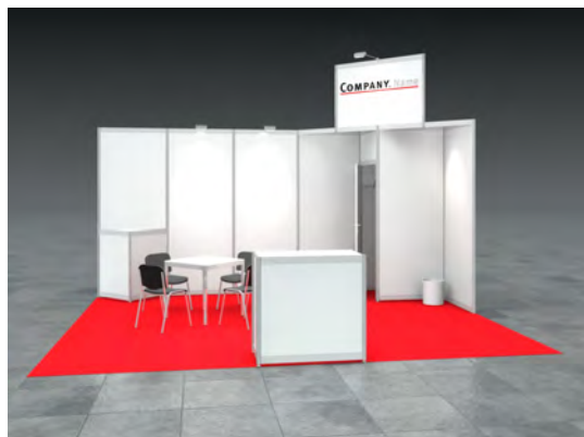
Example: 20sqm head stand

We hereby order a rental stand MIA according to our stand size.