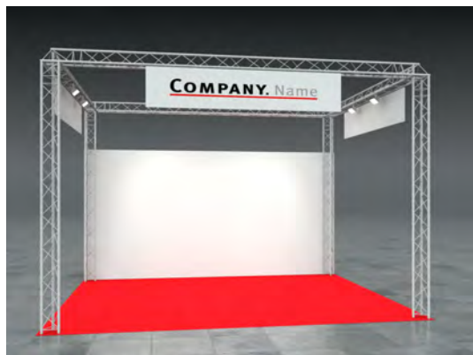
Example: 20sqm head stand