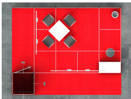
Stand view from above