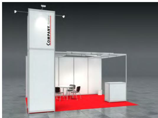
Example: 20sqm corner stand