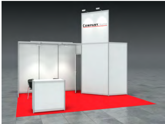
Example: 20sqm head stand