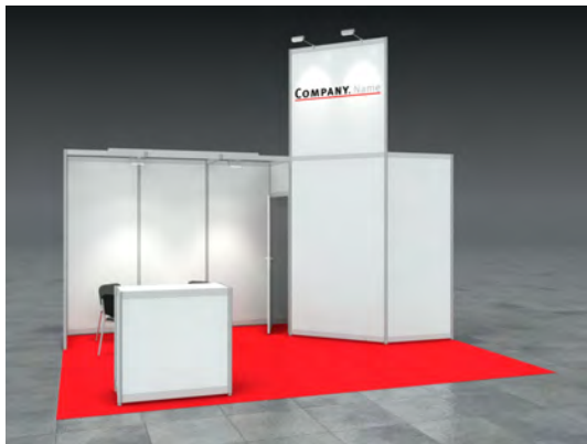
Example: 20sqm head stand