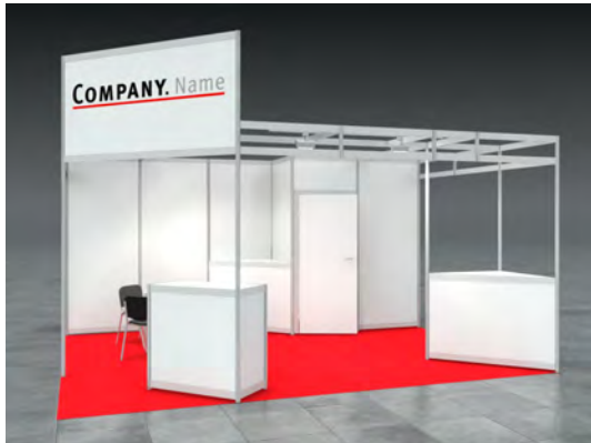
Example: 20sqm head stand

We hereby order a rental stand LOUIS according to our stand size.