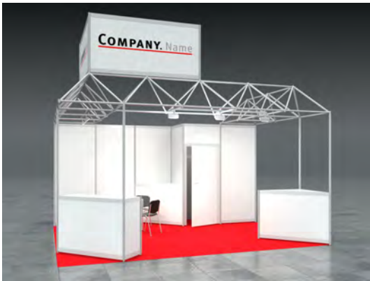
Example: 20sqm head stand