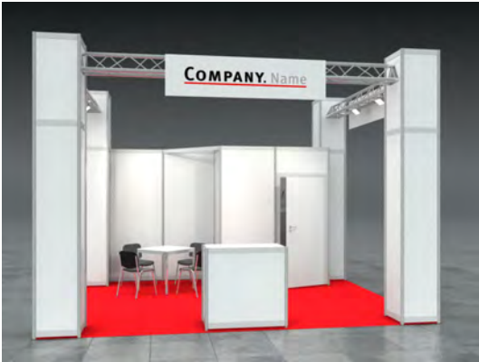
Example: 20sqm head stand