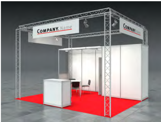
Example: 20sqm head stand