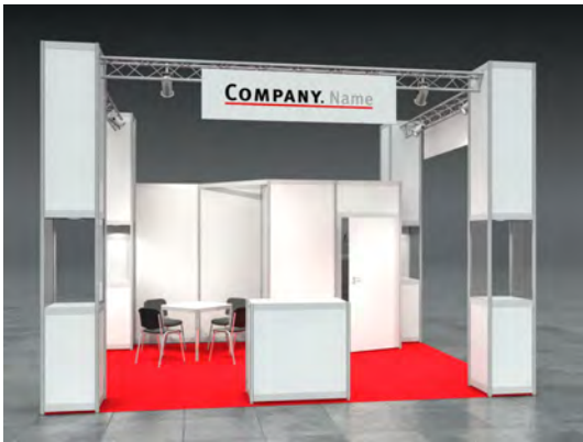
Example: 20sqm head stand