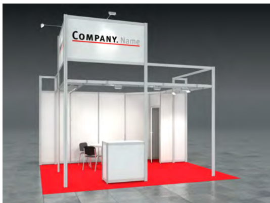
Example: 20sqm head stand

We hereby order a rental stand DEAN according to our stand size.