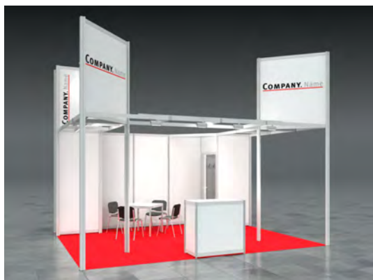
Example: 20sqm head stand

We hereby order a rental stand LUCY according to our stand size.