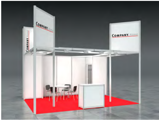
Example: 20sqm head stand