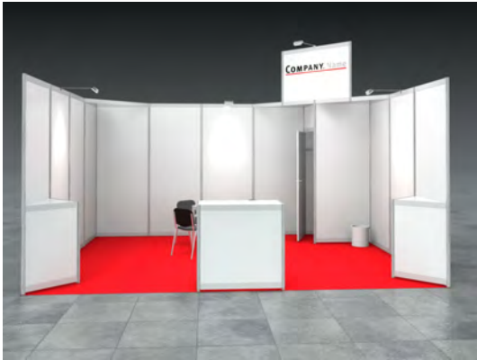
Example: 20sqm row stand

We hereby order a rental stand MIA according to our stand size.