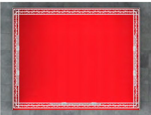
Stand view from above

The rental prices apply for a stand size at least of 20 sqm. or more. Stands of 31sqm and more 10% discount. Stands of 51sqm and more 20% discount. Stands to 19sqm or less 15% surcharge.