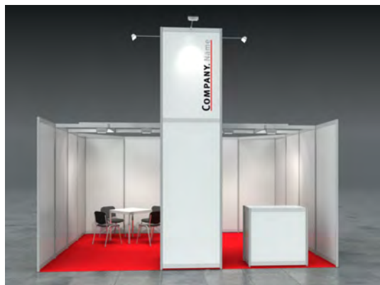
Example: 20sqm row stand