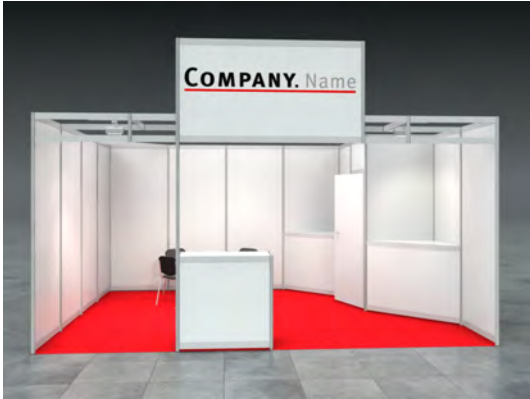
Example: 20sqm row stand

We hereby order a rental stand LOUIS according to our stand size.