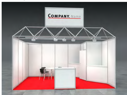
Example: 20sqm row stand