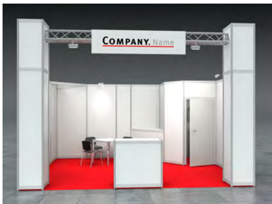
Example: 20sqm row stand