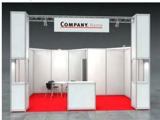
Example: 20sqm row stand