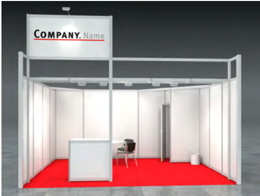
Example: 20sqm row stand