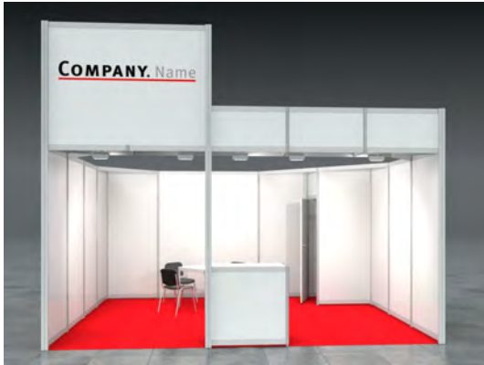
Example: 20sqm row stand