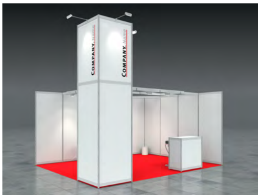
Example: 20sqm corner stand

We hereby order a rental stand COLLIN according to our stand size.