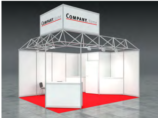
Example: 20sqm corner stand

We hereby order a rental stand SUMMER according to our stand size.