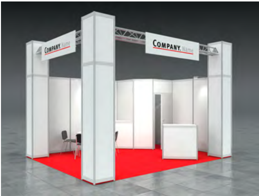
Example: 20sqm corner stand

We hereby order a rental stand DAVID according to our stand size.