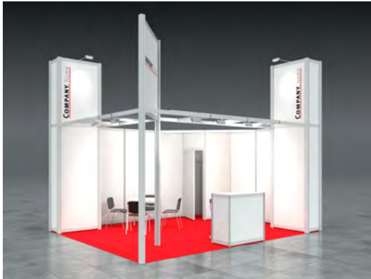
Example: 20sqm corner stand

We hereby order a rental stand LUCY according to our stand size.