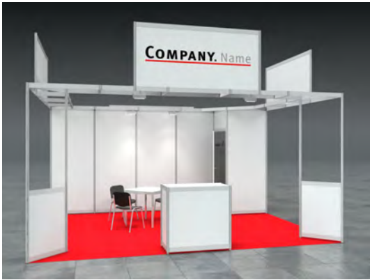
Example: 20sqm head stand

We hereby order a rental stand SAM according to our stand size.