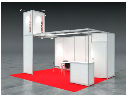
Example: 20sqm head stand

We hereby order a rental stand HOLLY according to our stand size.