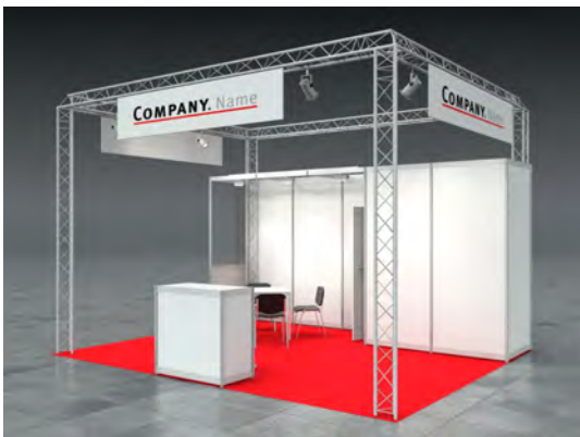
Example: 20sqm head stand

We hereby order a rental stand DONNA according to our stand size.