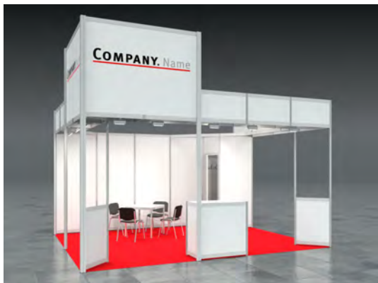
Example: 20sqm head stand

We hereby order a rental stand JAMES according to our stand size.