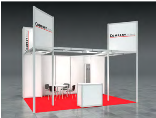
Example: 20sqm head stand

We hereby order a rental stand LUCY according to our stand size.