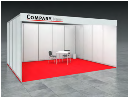
Example: 20sqm row stand

We hereby order a rental stand BEN according to our stand size.