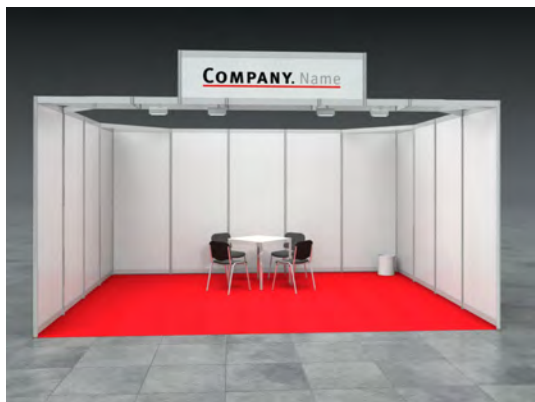
Example: 20sqm row stand

We hereby order a rental stand ADAM according to our stand size.