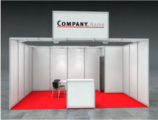
Example: 20sqm row stand

We hereby order a rental stand SAM according to our stand size.