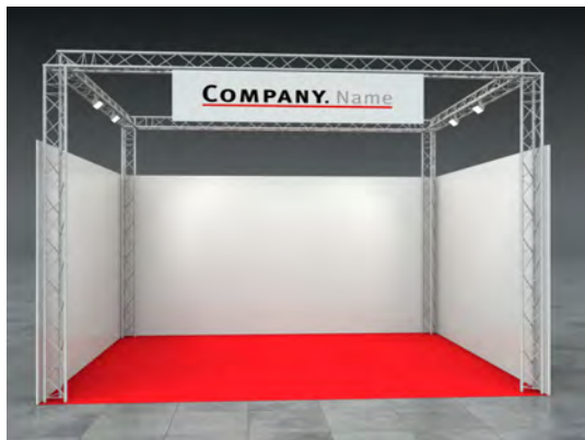
Example: 20sqm row stand