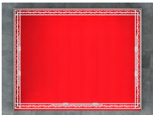
Stand view from above