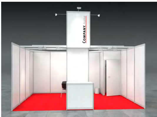
Example: 20sqm row stand

We hereby order a rental stand HOLLY according to our stand size.