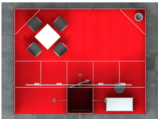
Stand view from above

The rental prices apply for a stand size at least of 20 sqm. or more. Stands of 31sqm and more 10% discount. Stands of 51sqm and more 20% discount. Stands to 19sqm or less 15% surcharge.