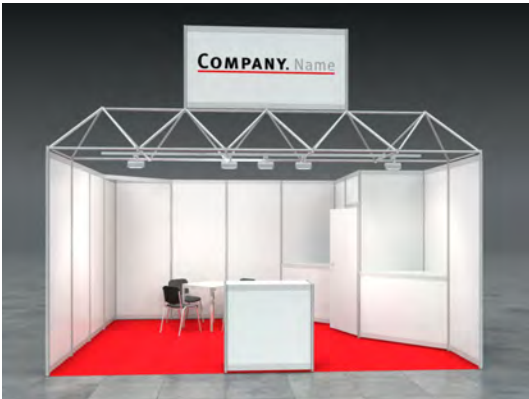
Example: 20sqm row stand

We hereby order a rental stand SUMMER according to our stand size.