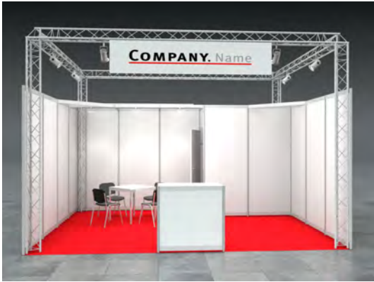
Example: 20sqm row stand

We hereby order a rental stand DONNA according to our stand size.